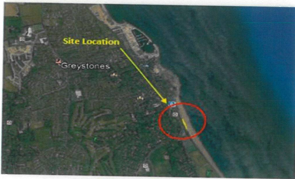
Figure 2: Site Location