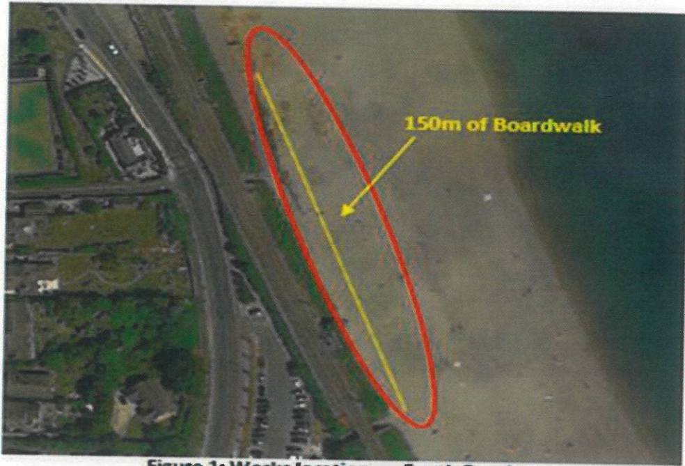
Figure 1: Works location on South Beach